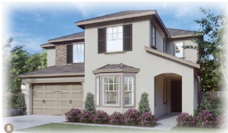
THE SPANISH ELEVATION