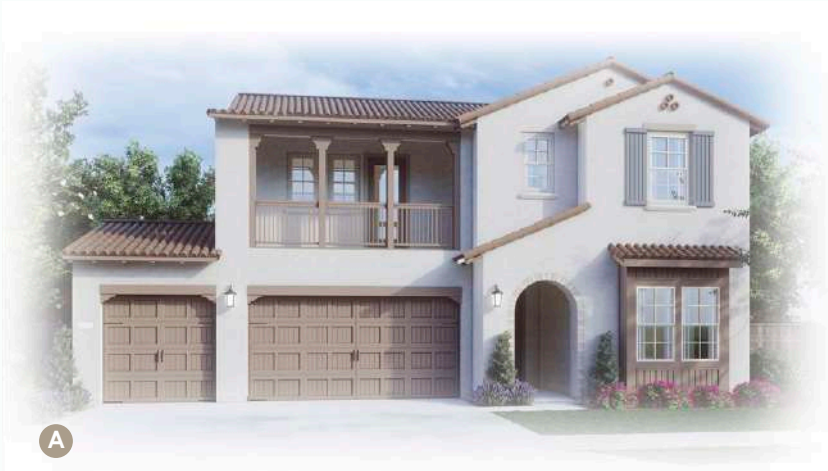
THE SPANISH ELEVATION Shown with Optional Balcony