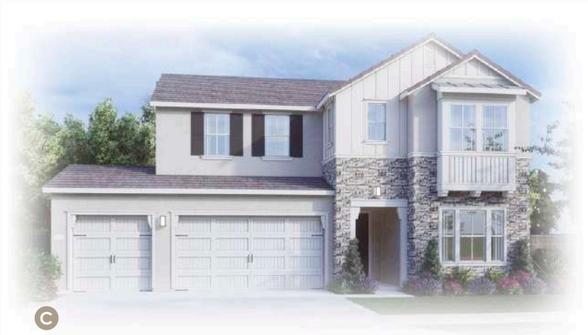
THE FARMHOUSE ELEVATION