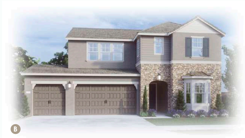
THE COTTAGE ELEVATION