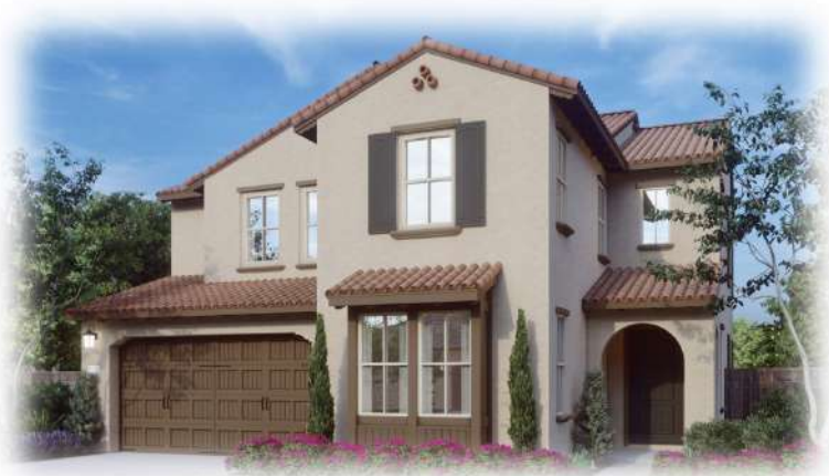
THE SPANISH ELEVATION