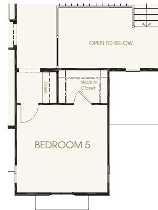
OPTION: Bedroom 5 in lieu of Loft