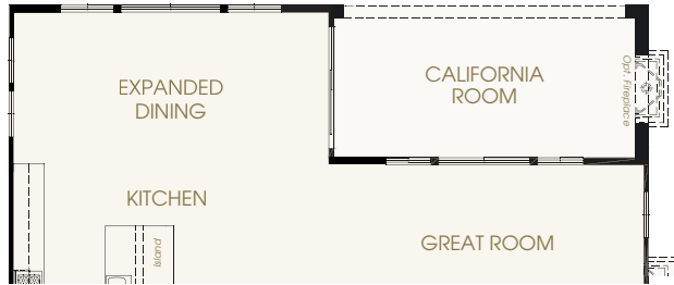
OPTION: Expanded Dining and California Room (Adds 215 Sq. Ft.)