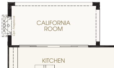
OPTION: California Room