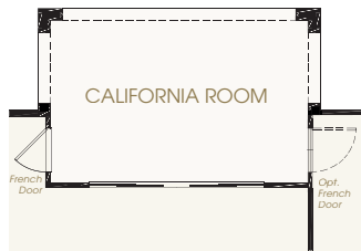
OPTION: California Room