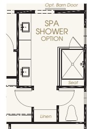
OPTION: Master Bath Spa Shower